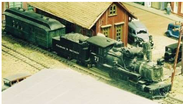
At the station

Well Kids we are coming to the end of our journey on Rocky Railroad and into the depot, but the doesn't mean we need to come to the end of our journey. Jesus died on the cross so that we could have eternal life and that our journey would never end. On the page with the videos are some Bible verses that show us how we can know for sure we are going to heaven.